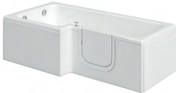
L shape shower bath end panel (right hand entry)