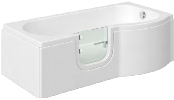
Concert end panel (left hand entry)