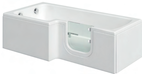
Solarna shower bath end panel (right hand entry)