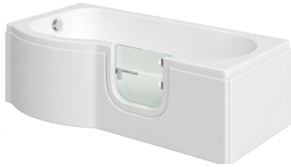
Concert end panel (right hand entry)