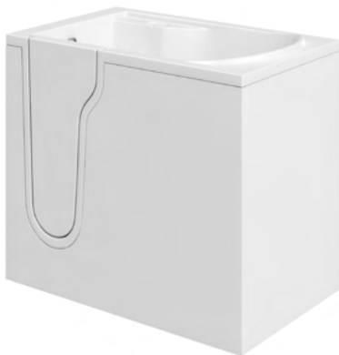
Freedom (left hand entry)