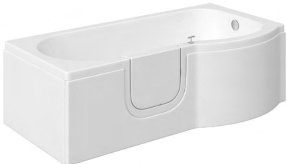
P shape shower bath end panel (left hand entry)