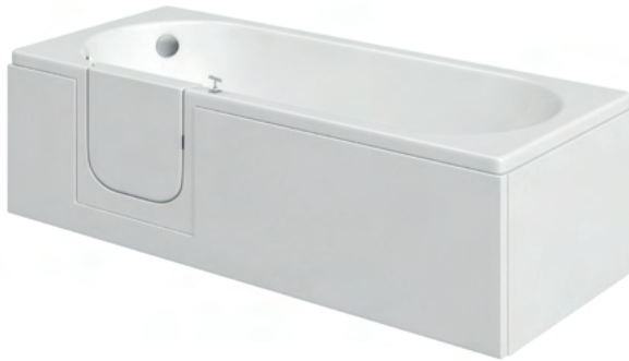
Standard SE (left hand entry)