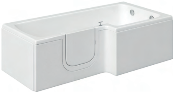
L shape shower bath end panell (left hand entry)