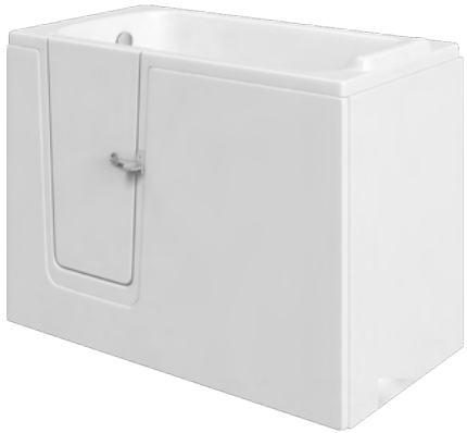
Deep Soak (left hand entry)