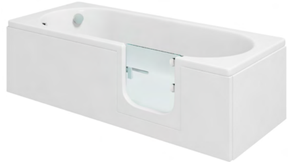
Cascade SE (right hand entry)

Please note the front panels are universal across both glass and GRP doors.