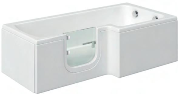
Solarna shower bath end panel (left hand entry)