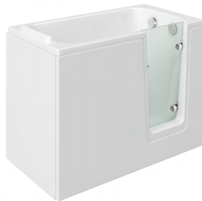
Comfort (right hand entry)

Please note the front panels are universal across both glass and GRP doors.